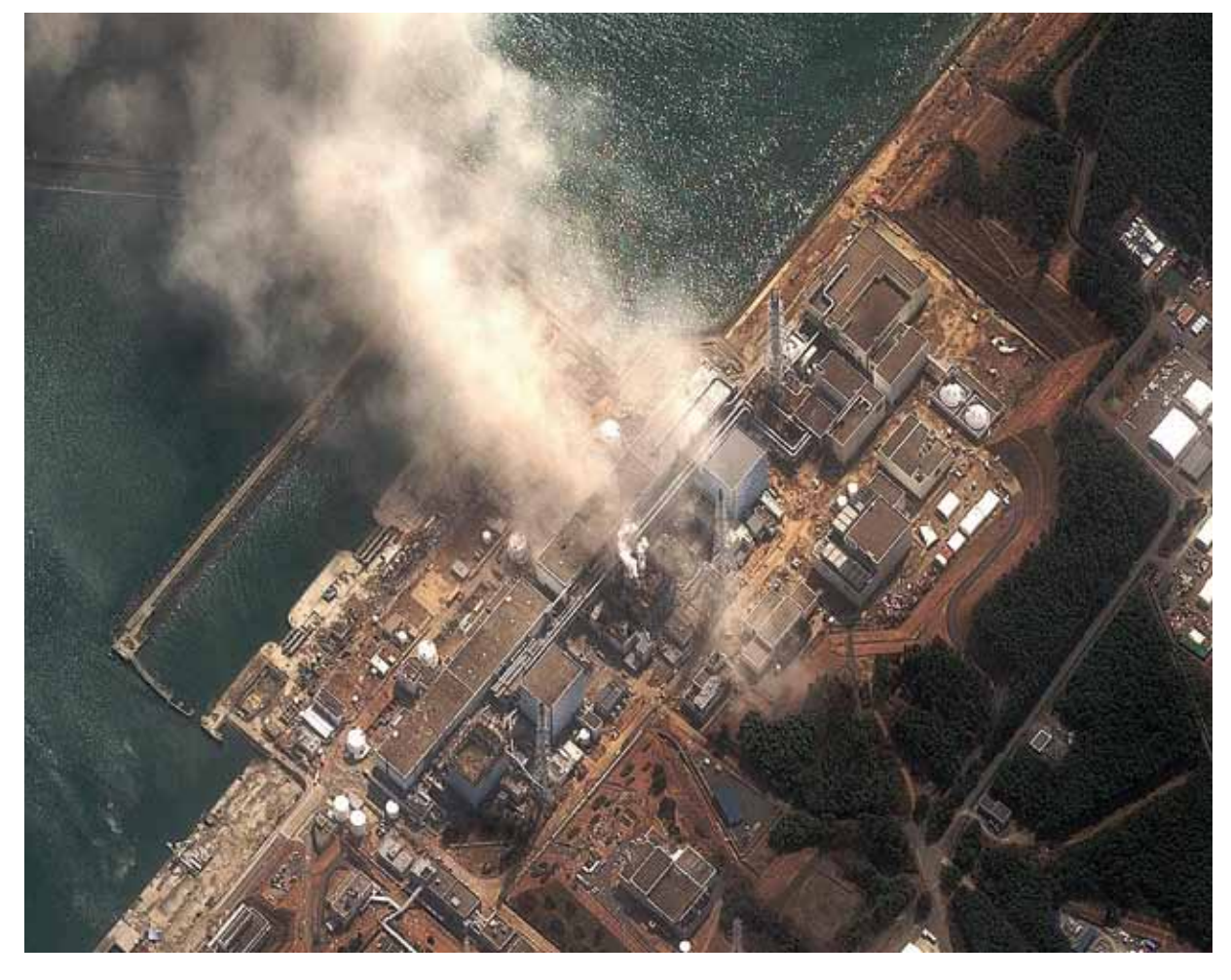
Image A satellite image shows damage at the Fukushima nuclear power plant. The damage was triggered by the offshore earthquake that occurred on 11 March 2011.

For example, even when the problems, weaknesses and scandals of TEPCO came to the surface, regulators never enforced sufficiently strong measures to avoid the same things from happening again and again and again. On occasions when regulators finally requested certain modifications, they allowed many years to go by before these were implemented. This is exactly what proved to be fatal in Japan in 2011.